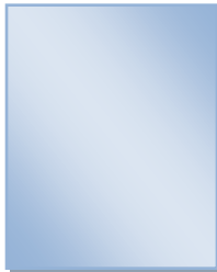
FULL PAGE 7.75"h X 4.75"w

___ HALF SEASON $300 ___ FULL SEASON $450